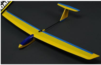
Description: Hand-launched gliders Wing Span: < 2 meters Weight: < 1.5 kg.