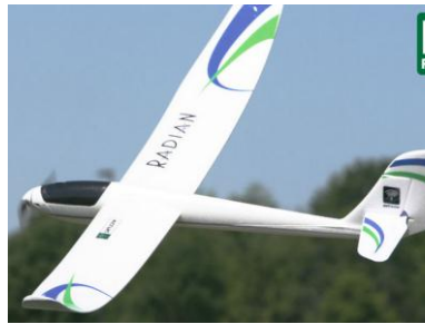
Description: Electric sailplanes Wing Span: < 2 meters Weight: < 1.5 kg.