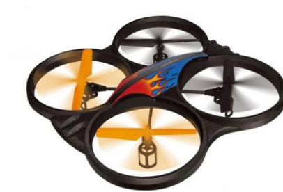
Description: Electric quadcopters (drone) Weight: < 1.5 kg.