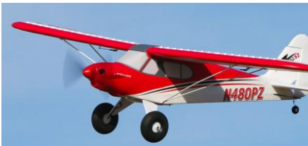
Description: Electric model aircraft Wing Span: < 2 meters Weight: < 1.5 kg.