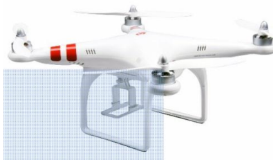
Description: Electric quadcopters (drone) Weight: < 1.5 kg.