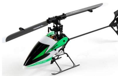
Description: Small electric helicopters Rotor Span: < 500 mm Weight: < 1.5 kg.